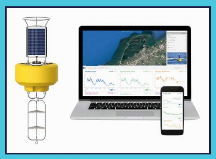
Graphic rendering of new buoy system

Due to unresolvable communications issues between the local internet provider and the previous CREWS buoy, CCMI has decided to invest in a new buoy, which was purchased at the end of 2017 and will be deployed in 2018. This system will communicate via realtime data streaming to computers and mobile devices. It contains an updated sensor platform which will monitor weather (wind speed, direction, gust, rain gauge, barometric pressure, air temperature) and light conditions above and below water, CTD (conductivity, temperature and depth), PH, and dissolved oxygen. It is powered by solar panels and will be significantly smaller than the previous buoy, making it easier to deploy and remove in the event of severe weather. It will also have far less expensive and intensive maintenance requirements.