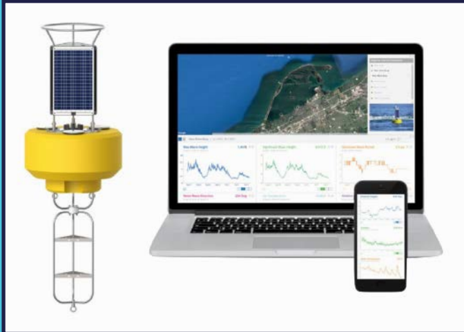
Graphic rendering of new buoy system

Due to unresolvable communications issues between the local internet provider and the previous CREWS buoy, CCMI has decided to invest in a new buoy, which was purchased at the end of 2017 and will be deployed in 2018. This system will communicate via realtime data streaming to computers and mobile devices. It contains an updated sensor platform which will monitor weather (wind speed, direction, gust, rain gauge, barometric pressure, air temperature) and light conditions above and below water, CTD (conductivity, temperature and depth), PH, and dissolved oxygen. It is powered by solar panels and will be significantly smaller than the previous buoy, making it easier to deploy and remove in the event of severe weather. It will also have far less expensive and intensive maintenance requirements.