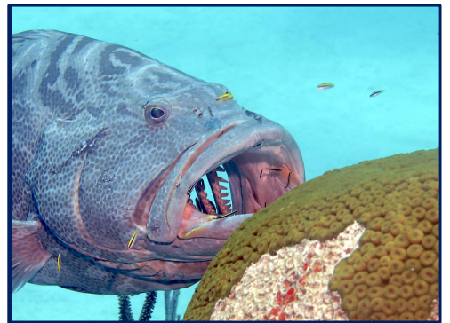
Groupers and cleaning gobies