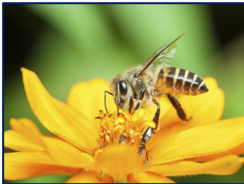
Bees and flowers